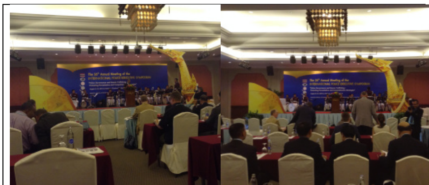
Figures 1 and 2: Thai Police Band at the IPES, 2015

Shinawatra University was honoured to be given the opportunity to host the 26 th International Police Executives Symposium in August, 2015. The symposium was held in Pattaya at the well-appointed Ravindra Resort there. The purpose of the symposium is to bring together practitioners, senior police executives, academics and other interested people from around the world to share best practice, new knowledge and technology and to mark advanced policing work and the efforts made by police forces internationally. The theme of this year's conference was human trafficking, which was particularly relevant for Thailand, as media headlines throughout the year have made evident.