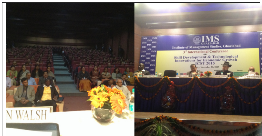
Figures 1 and 2: Audience and Invited Speakers