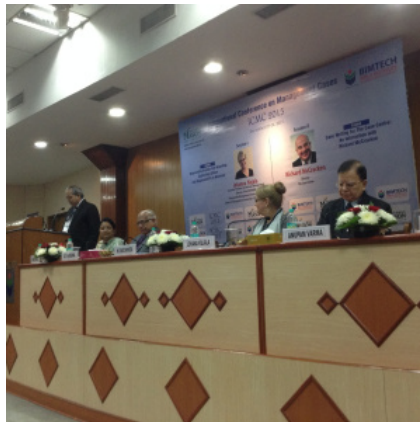
Figure 1: VIPs at the Opening Ceremony of ICMC, 2015